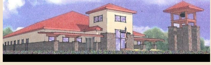
2013 - Present