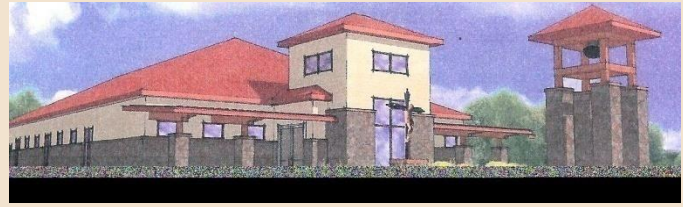
2013 - Present